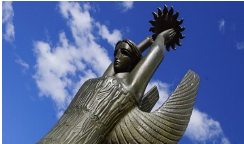
Ethos, Tom Bass, 1961. Ethos was the first work of art commissioned for a public place in Canberra, and stands outside the ACT Legislative Assembly.

Hotel Realm, 18 National Circuit Barton, Canberra, Australian Capital Territory